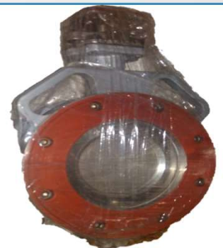
Item No : -OFF-HV-017

Body :- WCB /SS 304/SS 316 Disc :- SS 304/SS316 Shaft :- SS 410/304/316 Body Seat :- PTFE F to F :- API 609/BS 5155 MFG :- API 609 CAT B / BS 5155 OFFSET DISC HIGH PROFORMACE WAFER TYPE Flange std. :- ASME B 16.5,16.47 150#/AWWA C 207 SIZE :- 80MM TO 600MM