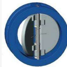
16" Dual Plate check valve