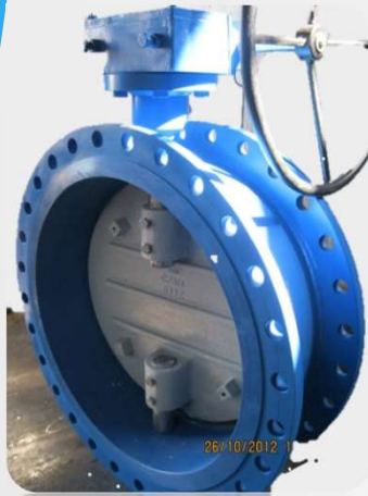
24" Offset/Tripplle offset disc Butterfly valve