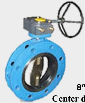
8" Center disc Butterfly valve