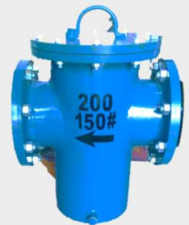
8" Basket Type Strainer

Address : - 6, Sohail Park, Al-Kamar Soccity, b/h Royal akber tower Sarkhej Road Ahmedabad 380055 Gujarat, India. Mo : - +91 9687786091 (L)079-26829362 Web: -Email h valves1@gmail.com