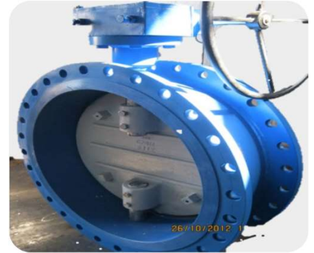
Item No : -OFF-BFV-015

Body :- C.I/ WCB/ SS 304/SS316 Disc :- WCB/ SS 304/SS316 Shaft :- SS 410/304/316 Body Seat :- SS 304/SS 316 Disc seal ring :- EPDM/NBR/VITON F to F :- API 609/BS 5155 MFG :- API 609 CAT B / BS 5155 OFFSET DISC DOUBLE FLANGE/WAFER TYPE Flange std :- ASME B 16.5,16.47 150#/AWWA C 207 SIZE :- 80MM TO 900MM