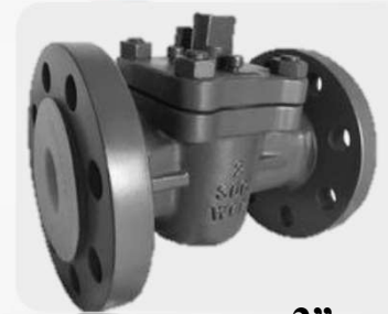
2" Plug Valve