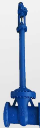
10" Gate Valve with Extended shaft