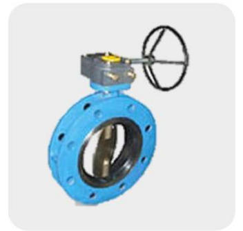
Item No : -OFF-BFV-016

Body :- C.I/ WCB/ SS 304/SS316 Disc :- WCB/ SS 304/SS316 Shaft :- SS 410/304/316 Body Seat :- EPDM/NBR F to F :- API 609/BS 5155 MFG :- API 609 CAT A / BS 5155 CENTER DISC DOUBLE FLANGE / WAFER TYPE Flange std. :- ASME B 16.5,16.47 150#/AWWA C 207 SIZE :- 80MM TO 900MM