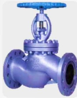
4" Globe Valve