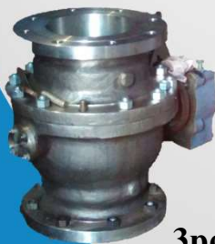
10" 3pc Ball valve 300# Gear Operated